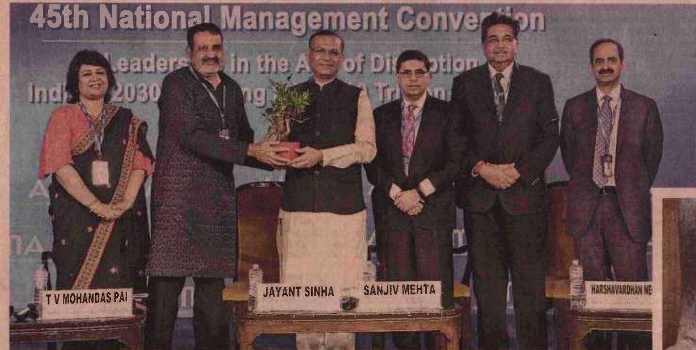
T V MOHANDAS PAI